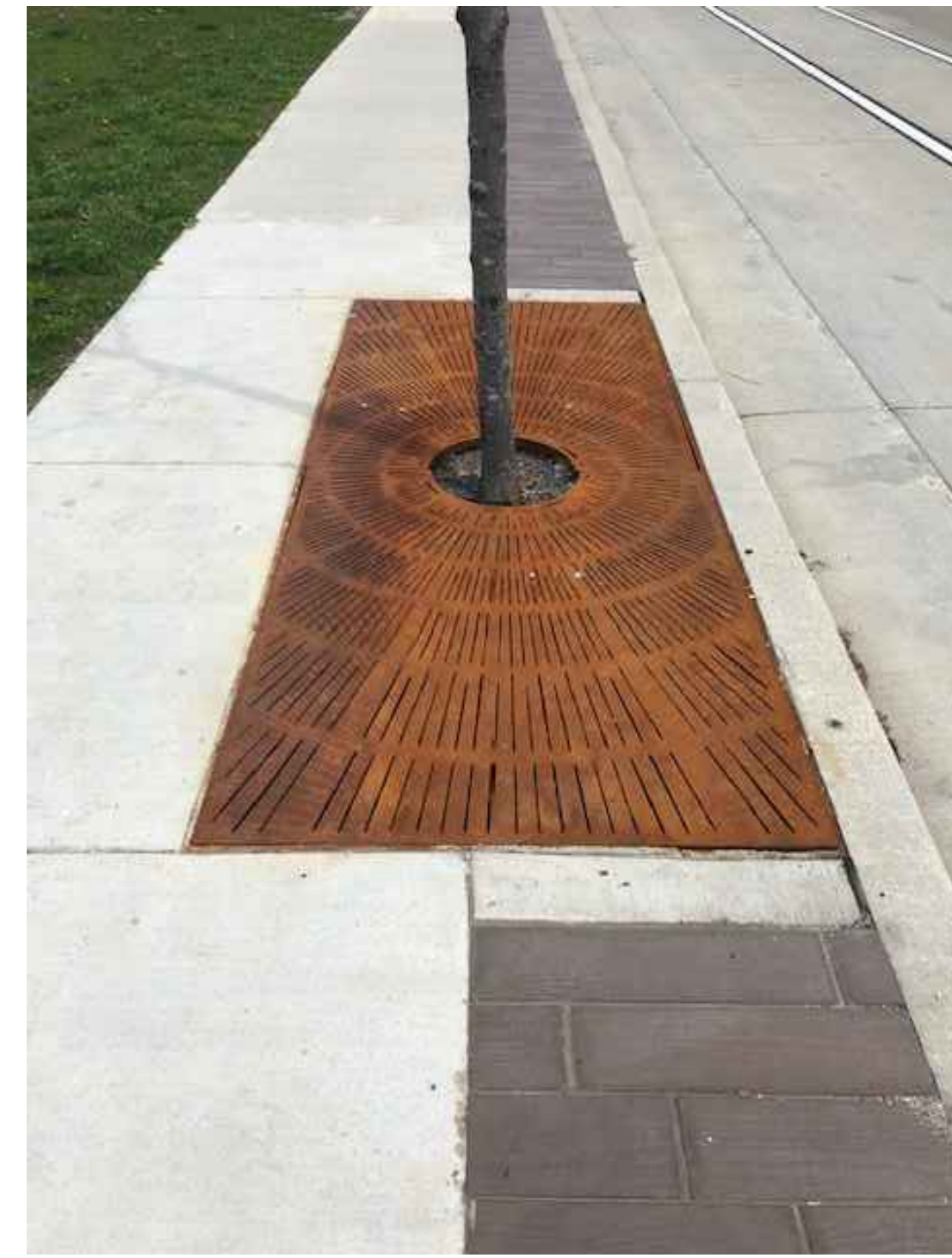
3' X 12' DECORATIVE TREE GRATES BY NEENAH FOUNDRY